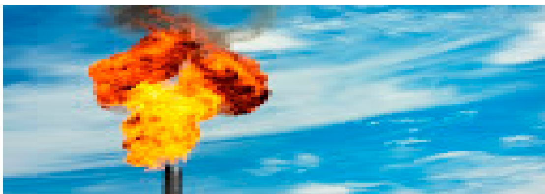
Figure 2. Gas Flaring in Nigeria's Upstream Petroleum Sector.