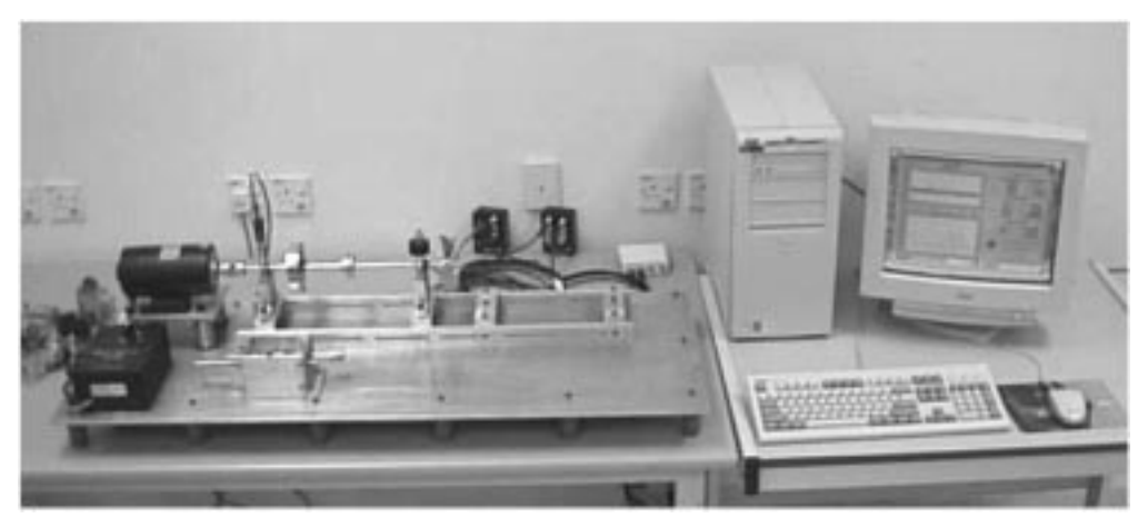
Fig. 2. Setup for automatic fault detection system.

Another project on visual tracking and manipulation implies an intelligent robot that can track the objects with a single camera and perform necessary manipulation. The knowledge of hardware, software and machine vision has been used in the design and implementation of these projects. Figure 2 depicts the setup for the project for detecting vibration fault signals in a rotating machine. This involves the designing of a test rig with supervisory software, which can automatically determine the type of fault using spectral analysis techniques. In general, all the projects assigned to the students should require the integration of knowledge from the variety of subjects taken by the students.