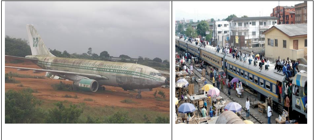
Fig 1: Lack of Public Transportation Policy leading to Transportation Challenges

Thus, this paper evaluate public transport policy in Nigeria by reviewing the national transport policy as it affects public transport, identify succinctly agencies involved and identify challenges affecting it with a view to proving a roadmap for its effective implementation.