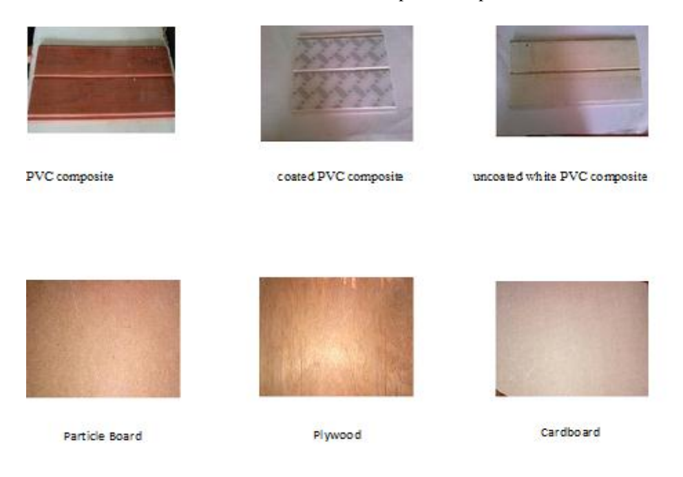
Plate: Samples of PVC and natural Ceiling Materials

International Journal of Applied Engineering Research ISSN 0973-4562 Volume 12, Number 23 (2017) pp. 14755-14758 © Research India Publications. http://www.ripublication.com