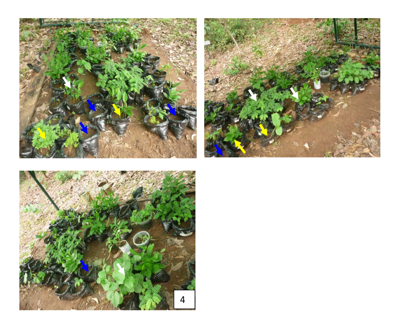
Plate 4: Seedlings after thirty days (30) of planting