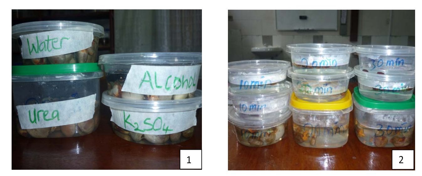
Plate 1 & 2: Seeds soaked in different treatments of water Urea, alcohol and potassium sulphate