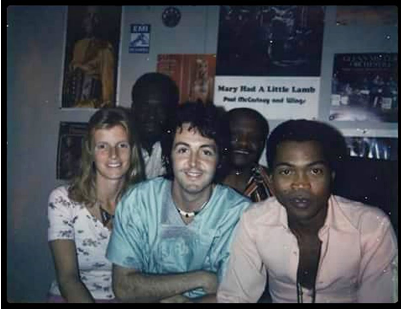
Figure 4. Fela Anikulapo Kuti and Paul McCartney at EMI Studio Lagos

The efforts and successes of these three companies encouraged private investment in the music sector, which resulted in the proliferation of homegrown record labels, while most record-distributing agents for the multinationals also turned to investing in recording studios and starting their own labels or imprints. Typical examples included Omo Aje Records, Ibukun Orisun Iye Records, Shanu Olu Records, Tabansi, Roger All Stars and Skylark Records. In this period – that is, between the 1970s and the early 1990s – the popular way of storing and consuming music remained the vinyl record, and the manufacturing of records took place at Philips Vinyl Records and Records Manufacturing Nigeria Ltd (RMNL), both in Lagos, and later by some of the independent investors who set up their own manufacturing outfits, like Tabansi, Phonodisk and Shanu Olu Trading Company, in Ijebu Ode.