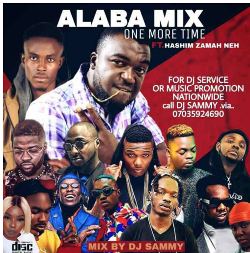
Figure 2. Alaba mix tape on CD

With respect to copyright and intellectual property protection, the issue of Alaba mix-tape and compilation CD releases is viewed dif-