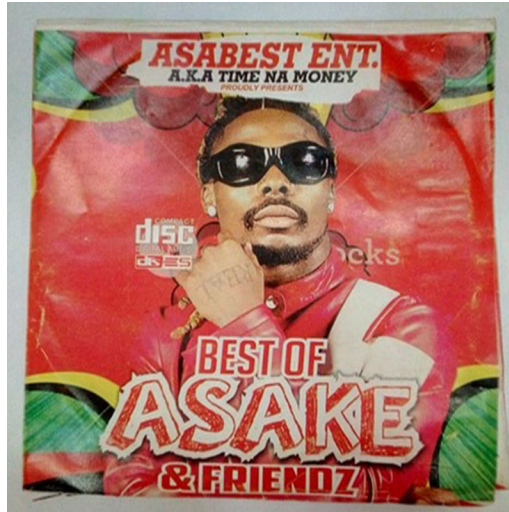
Figure 3. The Best of Asake Alaba compilation CD