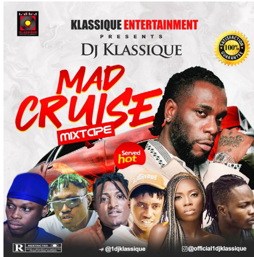
Figure 6. Online DJ mix album art

Another dimension to copyright infringement online comes from within the industry itself. It involves the particular infringement of DJs, but it relates to creative innovations and mixes, and this is why it has been difficult to enforce the law. The issue is the creation by DJs of mixes and mix tapes from various hit songs which is promoted on various sites for consumers to download for free (Fig. 6). These mixes are very popular amongst music consumers and are constantly played at home, offices, inside vehicles and at parties. There also exists illegal profiteering on music by computer technicians and information technology item sellers in most computer villages (also called ‘slots’) across the country. These sets of people operate their own digital music shops with their repertoire of illegally downloaded music in their hard drives, which they sell to consumers who bring various devices like flash drives and mini-SD cards to collect the music for their personal use.