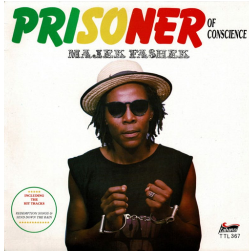
Figure 5. Majek Fashek's Prisoner of Conscience on vinyl, Tabansi Records 1989

Kimono. This period can best be described as the golden age of the Nigerian recording industry, which gradually transitioned in the 1990s to a scene characterised by the emergence of reggae as the new mainstream music style and by the systematic decline in the popularity of the vinyl record with the gradual rise of the new music storage format of the cassette tape. This decline, referred to as the 'Nigerian recording industry crisis' by Tom Simmert (2020), would give way to the present-day setting of various different genres, though especially hip-hop and Afrobeats, existing alongside serious piracy concerns.